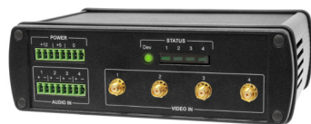
STC-H655.4 4-channel Audio/Video Recorder